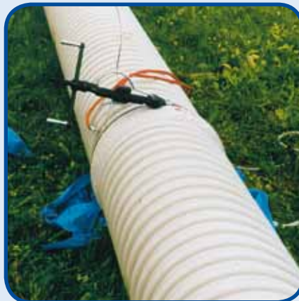
Integrated electro fusion socket

Integrated electro fusion sockets from DN 300 – DN 2400 for a quick and easy pipe connection by electro fusion welding.