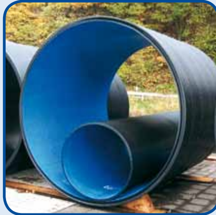
Co-extruded inner surface made of special material

Pipes can be produced by co-extrusion with an inspection friendly light inner surface. In explosive areas both inner and outer surface can be produced from an electro-conductive material.