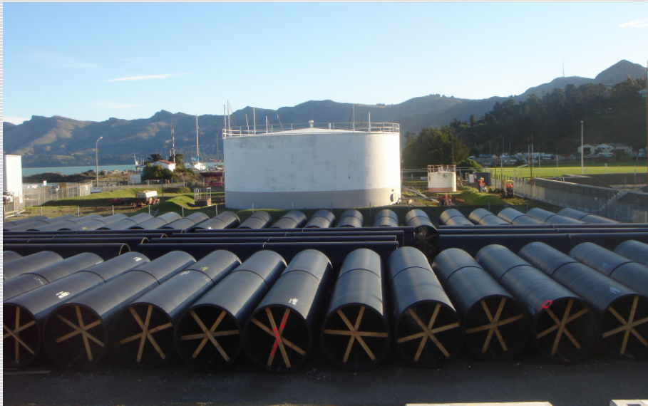
Picture 1: OD 1800mm pipe in 12m-length prepared for welding of 300m-sections